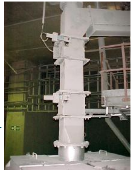
Silo Discharge Arrangement - Wet Unloading System with Gravity Flap Valve with potentiometer on top and a normal Single Gravity Flap Valve at the bottom