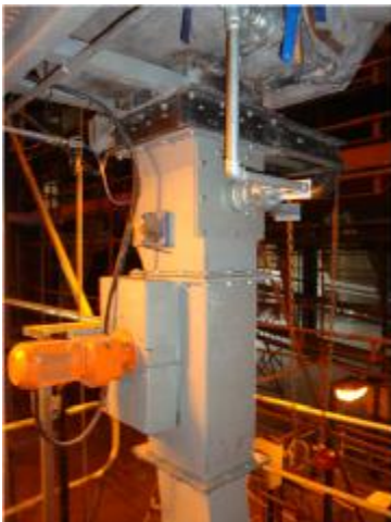
Motorised Double Flap Valve application