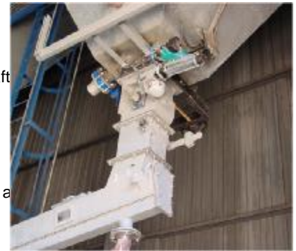
Flow Control Valve with Single Flap Valve application