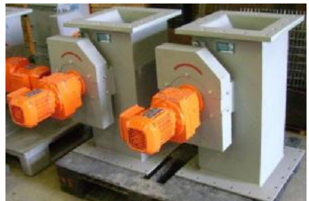
Motorised Double Flap Valve