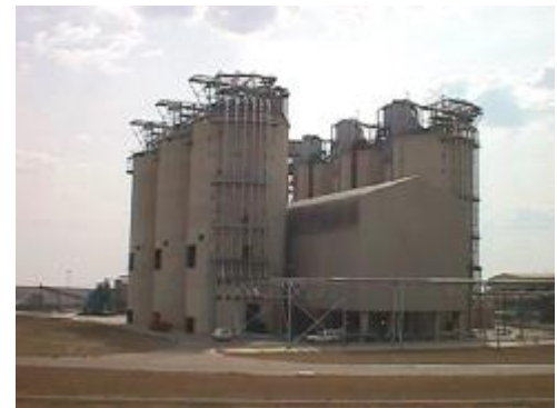
Ash storage silo with pneumatic conveying piping and dust suppression filters