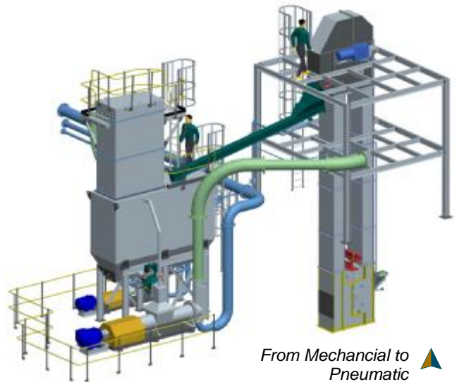
From Mechanical to Pneumatic