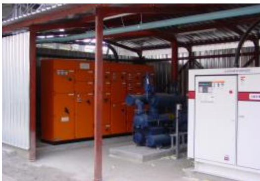
Electrical System Upgrade