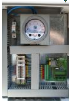
Silo Discharge arrangement with Flow Control Valve & Knife Gate Valve