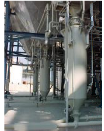
Multi-TSS Pressure Vessel System