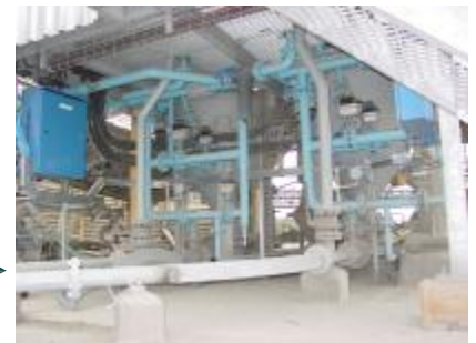
Double Pressure Vessel system