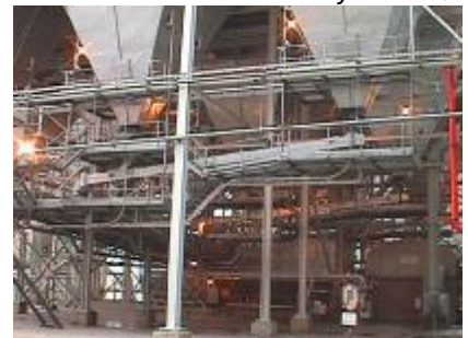
Typical Silo Aeration Pad Installation