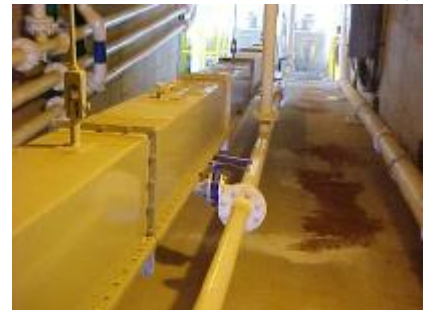
Dust Handling Plant Aeroslide System